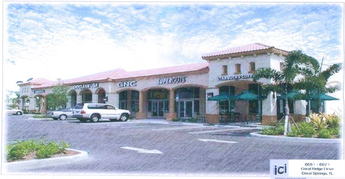
6051 - 6071 Coral Ridge Drive Coral Springs, FL