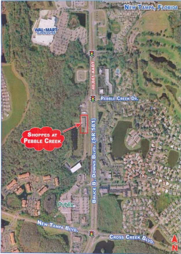
Exhibit "A" Shoppes at Pebble Creek 19402 – 19416 North Bruce B. Downs Boulevard Tampa, FL 33647